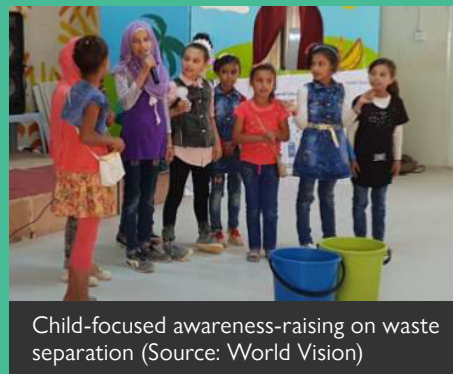
Child-focused awareness-raising on waste separation